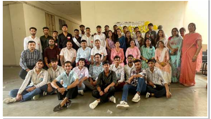
Farewell in ECE Department