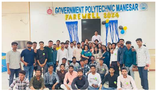
Farewell 13.06.24 in Civil Department Farewell in Civil Department