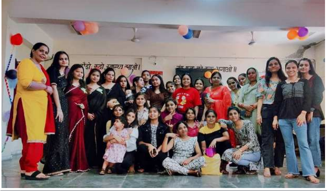
Farewell function in Girls Hostel

This is the time when final year students are blessed with good wishes for their future. In order to keep the purest and the sweetest memories in the mind, farewell parties were organized by different department of the institute for outgoing 2021 batch students.