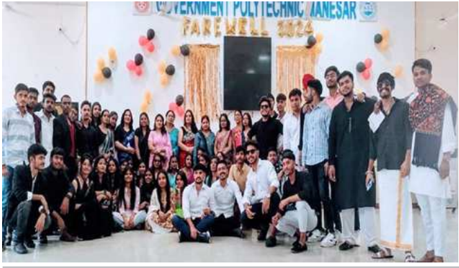
Farewell in Computer Department