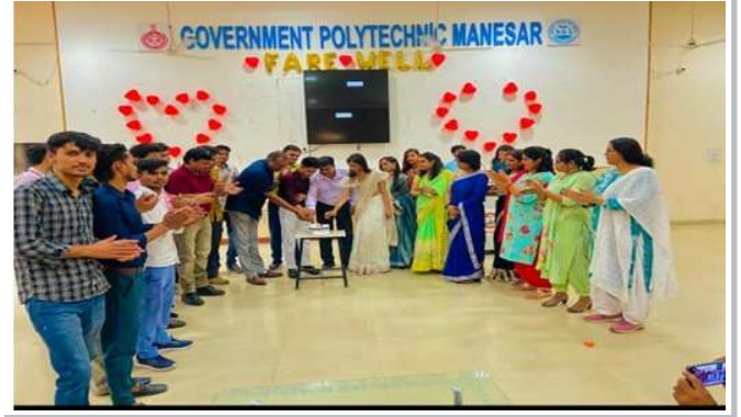
Farewell in Electrical Department